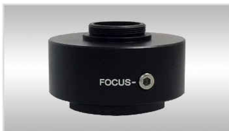
Olympus® Microscope Adapter