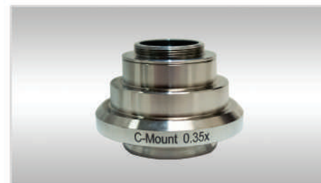
Leica® Microscope Adapter