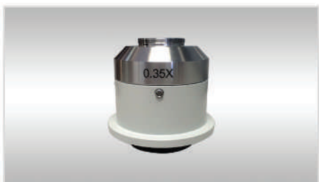
Nikon® Microscope Adapter