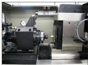
Removable Linear Y-axis