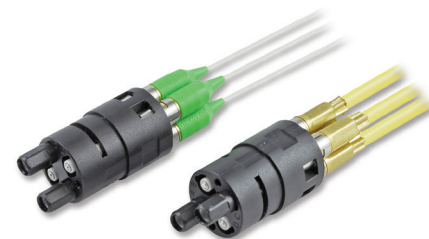
Diamond Multipurpose (DM) insert