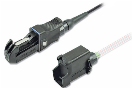
HE-2000™ plug connector on multi-fiber cable and bulkhead receptacle