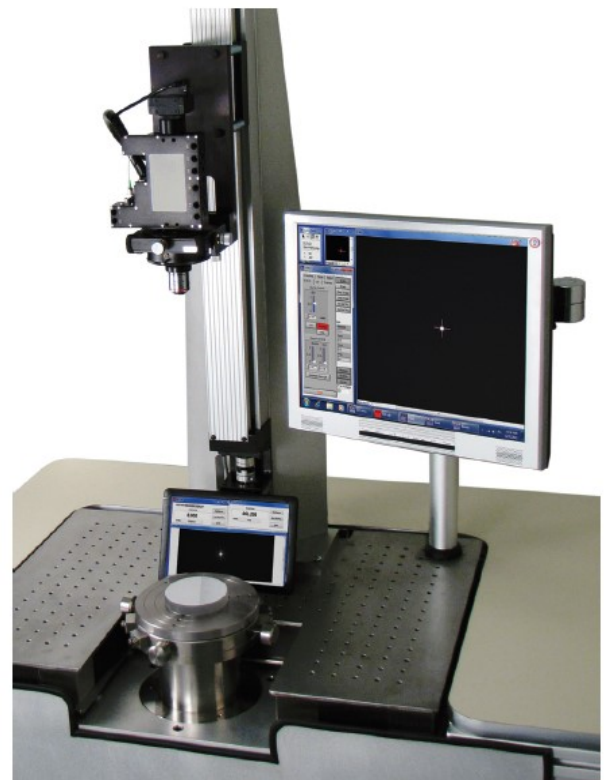
PSM on optional centering station.

Find out more ways the Point Source Microscope can speed assembly and alignment; visit www.optiper.com