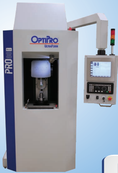
PRO 80 UFF